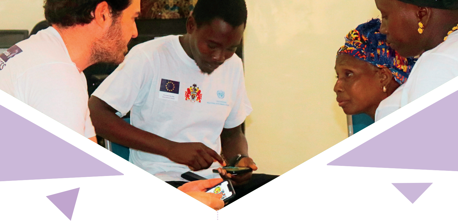
Group exercise: The team from CRR-North creating social media tools

The workshop introduced participants to WACOMP-GM and its key awareness raising messages.