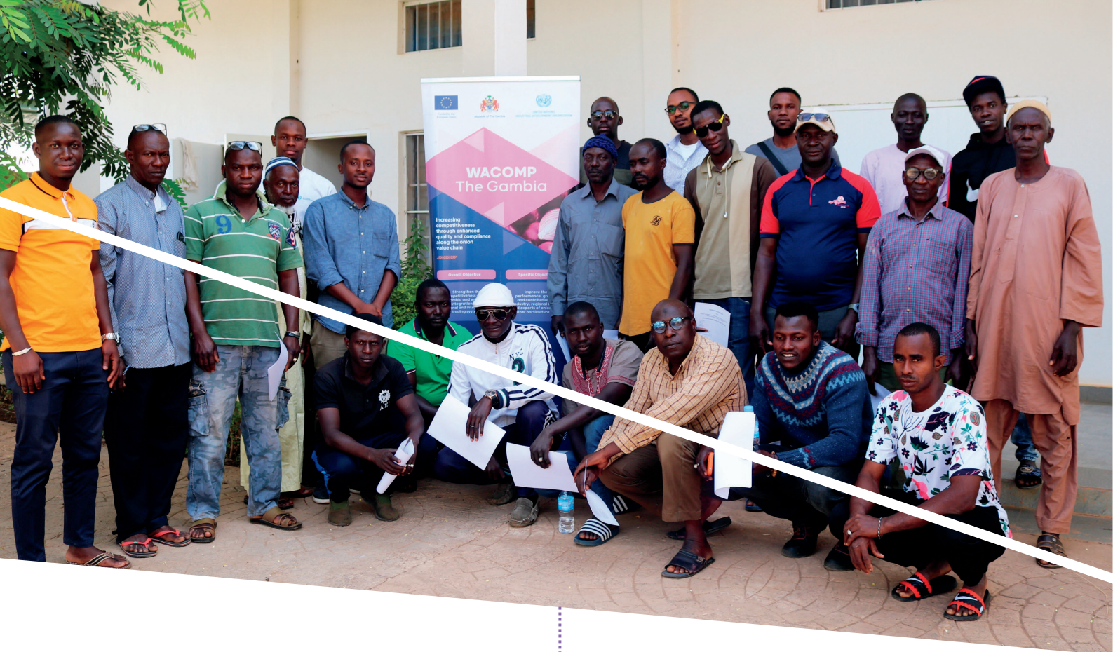
Group photo of participants