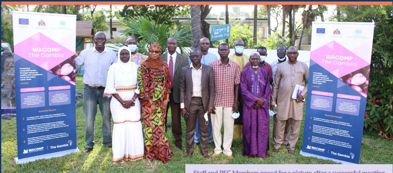
Staff and PSC Members posed for a picture after a successful meeting