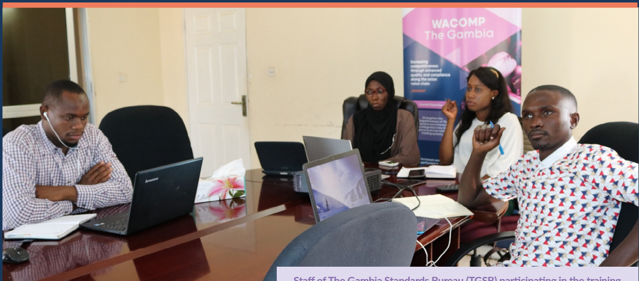
Staff of The Gambia Standards Bureau (TGSB) participating in the training

“My expectations from the participants are that they will utilise the knowledge gained and share with their colleagues as the training was a privilege and rare opportunity,” he said.