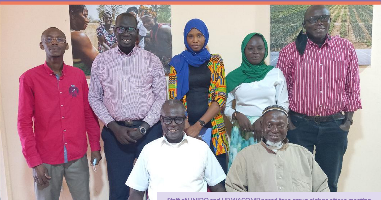
Staff of UNIDO and UP WACOMP posed for a group picture after a meeting

Both parties expressed the need to continuously communicate and share draft works to be informed and also to allow them to provide feedback on each other's works - instead of waiting for their finalization before sharing.