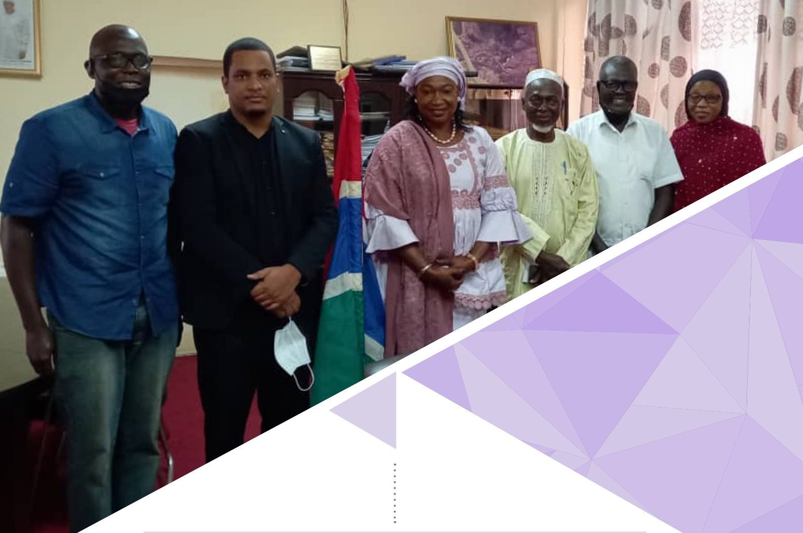
UNIDO International QI Expert, Prof. Dr. Adalberto Vieira and team meeting the minister of Agriculture

The gap analyses were carried out, as applicable, taking into consideration the ISO/IEC 17020:2012 (Conformity assessment – Requirements for the operation of various types of bodies performing inspection) and ISO/IEC 17025:2017 (General requirements for the competence of testing and calibration laboratories) requirements.