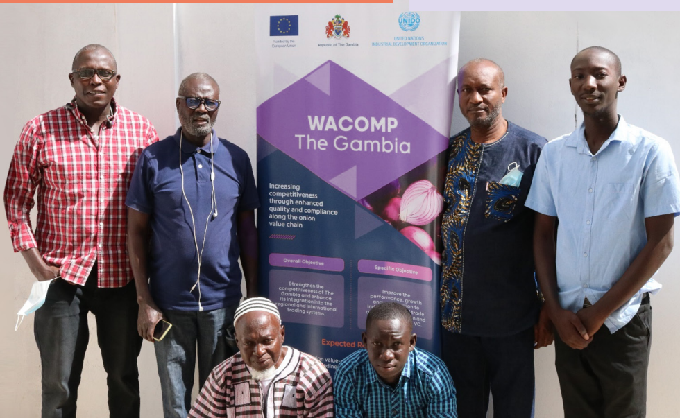
Staff of WACOMP-GM based in The Gambia

The specific objective is to improve the performance, growth and contribution to industry, regional trade and exports of onion and other horticulture value chain.