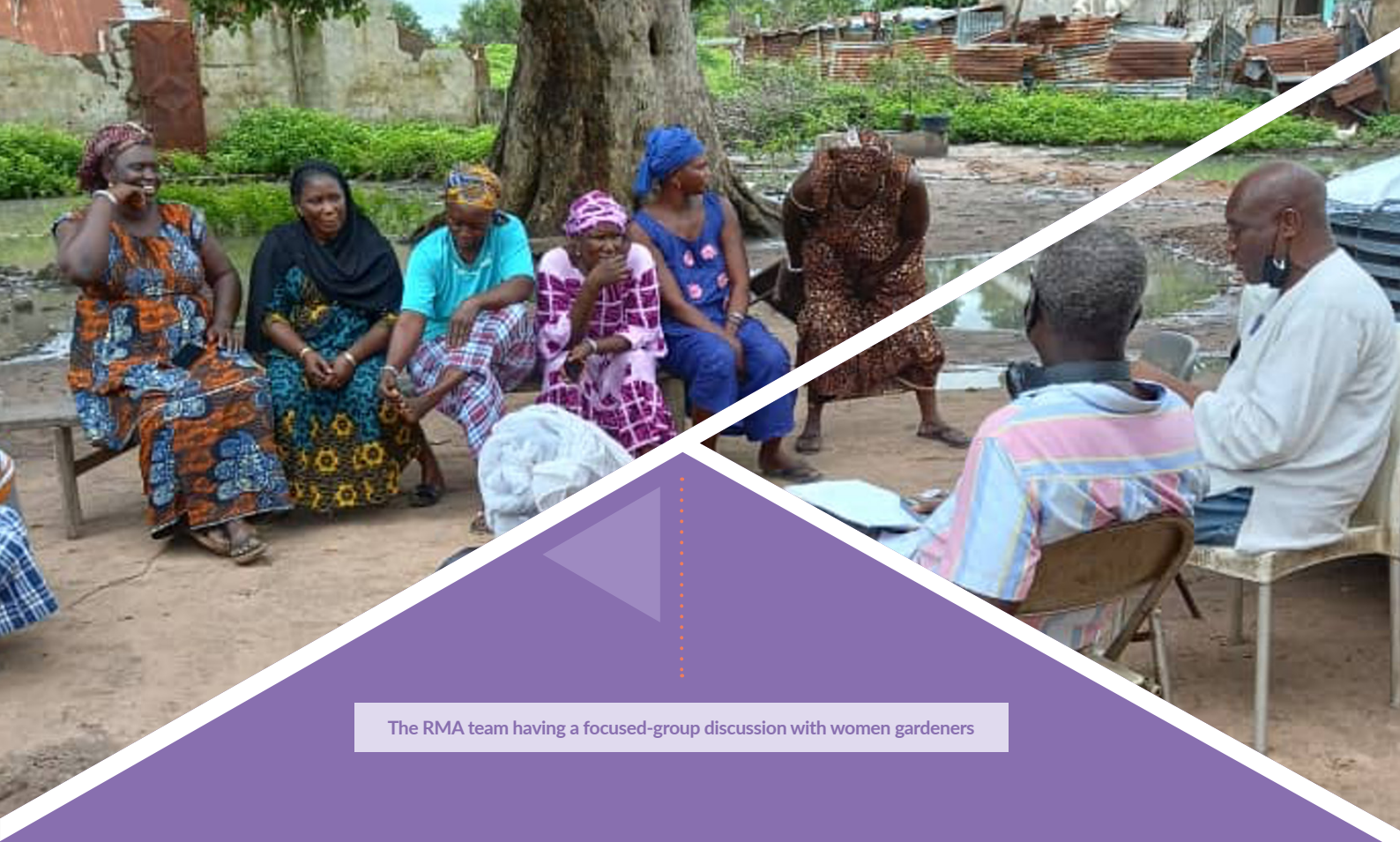
The RMA team having a focused-group discussion with women gardeners