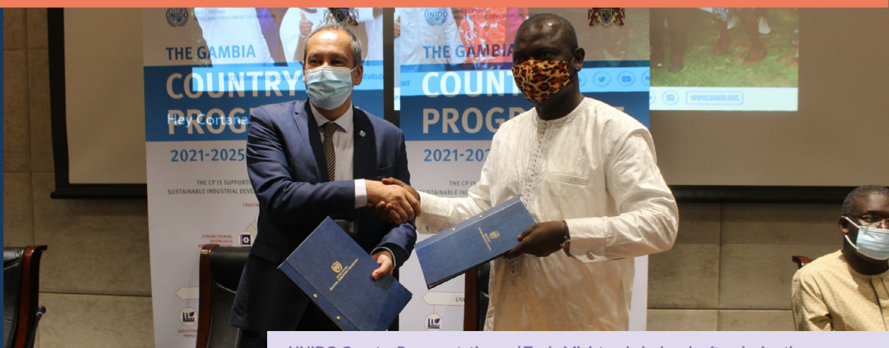
UNIDO Country Representative and Trade Minister shake hands after signing the programme

The team of WACOMP-GM has provided support and participated in the launch of the UNIDO Country Programme which took place at the Sir Dawda Kawraja Jawara International Conference Center on the 12th November 2021.