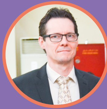
UNIDO WACOMP Project Manager