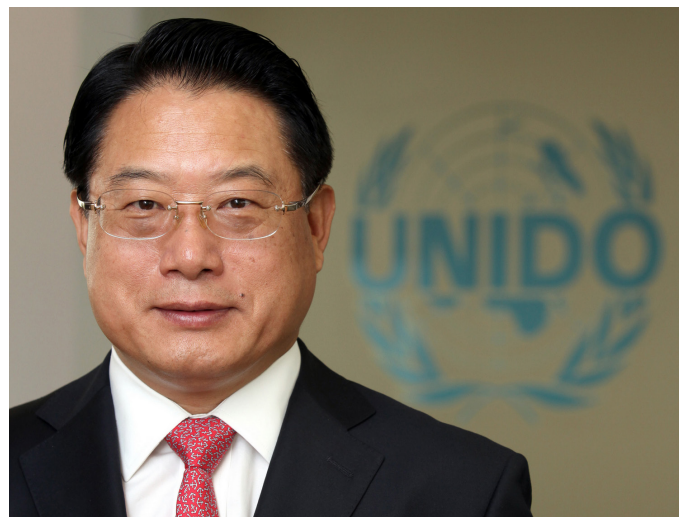
LI Yong DIRECTOR GENERAL

Most of all, the Feasibility Studies Series presents a fresh approach to promote effective investments towards the achievement of inclusive and sustainable industrial development.