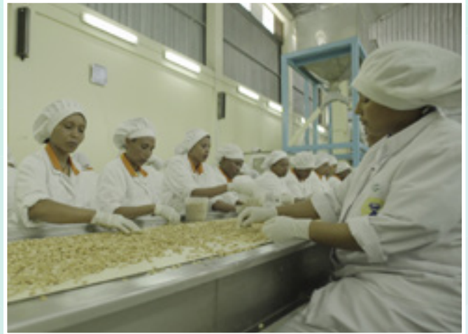
Women working in a peanut factory, Ethiopia

advisory services to set up and operationalize industrial parks and zones. Each one of these activities lends itself to gender initiatives within the technical area in question.