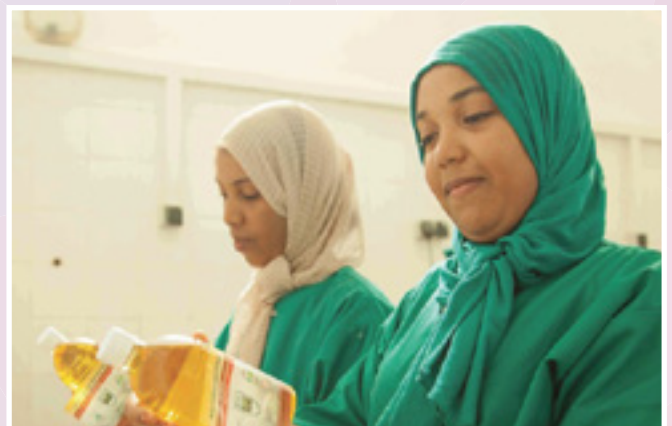
Export consortia workers examine an argan oil product, Projet d'Accès aux Marchés des Produits Agroalimentaires et du Terroir (PAMPAT), Morocco

The Swiss-funded project for the market access of traditional and typical food products (PAMPAT) has built capacity and provided training to more than 50 producers to comply with the recently introduced geographical indication and national law on safety and hygienic standards, also necessary to access international markets. Furthermore within the PAMPAT project, linkages and partnerships between cooperatives and companies have been set up, through the establishment of two export consortia. UNIDO experts assist consortia members, mainly females, to enhance their product quality and to better access markets, through branding and the participation in promotional and trade events in Europe, Africa and Middle East. As a result of the PAMPAT project, women cooperatives are now better integrated in the argan oil value chain and involved in producing certified geographically indicated argan oil with a higher value addition for local communities.