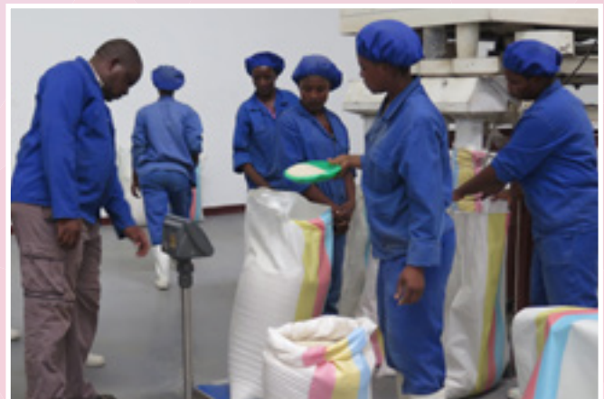
Measuring rice at a factory supported by the project: Market Access and Trade Capacity Building Support for Agro-Industrial Products & the development of a robust standardization, quality assurance, accreditation and metrology (SQAM) Infrastructure in Malawi

For instance, in Indonesia, TII is working to strengthen the trade capacity of selected value chains in the fisheries export sector, while simultaneously ensuring the preservation of biodiversity through promoting sustainable use of maritime resources by implementing the Sustainable Market Access through Responsible Trading of Fish (SMART-fish) project. This is carried out by boosting value-added to exports by advising the government to enact enabling policies for exports, strengthening the supply side aspects (improving competitiveness of products in terms of price and quality, branding, enhancing compliance with international market requirements, including certification for sustainability standards), and facilitating entry into the respective global value chains. The supply side will be further reinforced at the meso-level through a Quality & Productivity Centre at the Fisheries University to provide support to SMEs. Local expertise will be built through establishing a curriculum for a Masters training course on Quality, Productivity and Innovation where female participants are preferentially considered. Support to the international accreditation of a local body to certify producers against sustainability standards will make certification more affordable to local enterprises.