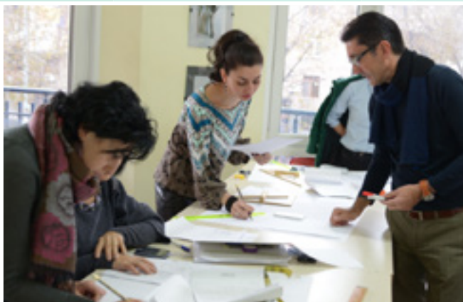
Fashion designers working in a textile and garment enterprise, supported by the project: Improving Competitiveness of Export-Oriented Industries in Armenia through Modernization and Market Access, Armenia

TII spearheads a range of technical assistance projects for the private sector to bolster its contribution to sustainable growth, employment and income generation. Private sector development can be successful in addressing and scaling up women's economic opportunities, contributing to skills development, fostering women-led businesses, and increasing access to networks as well as global markets. Nonetheless some aspects of business do not represent a level playing field for women and present many obstacles.