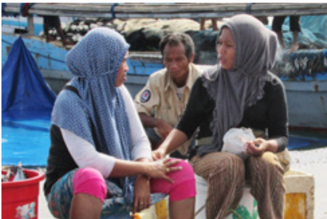
Women fishers sorting their fish, supported by the project : Sustainable Market Access through Responsible Trading of Fish (SMART-fish), Indonesia

By exporting to international markets, integrating into global value chains, and sourcing quality products at best value, producers around the world have the potential to expand their businesses, to upscale their production techniques and level of productivity, as well as to diversify their outputs. The massive expansion of global trade over the last two decades has brought with it both opportunities and obstacles for female workers in productive areas. The need to move goods over national borders has become ever more important, not only in terms of exports of finished products but also because the explosion of global value chains involves the transport of raw materials and semi-manufactured goods from country to country. Borders represent many challenges in terms of lengthily procedures and paperwork and, perhaps most hazardous of all, rejections of products on the grounds of non-compliance with a myriad of standards and other technical regulations.