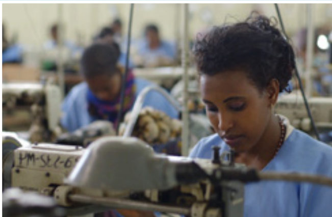
Women working in the leather industry, supported by the UNIDO Programme for Country Partnership (PCP), Ethiopia

UNIDO works at the macro-, meso- and enterprise- levels to upgrade and improve the competitiveness of sub-sectors and value chains. Within those sub-sectors, support is given to strengthen and establish clusters of mainly small formal enterprises as well as micro and informal enterprises where women entrepreneurs are prevalent. The process begins with the selection of the cluster, bearing in mind the geographical setting. Activities span all stages from a diagnostic study, through implementation, monitoring and evaluation. There is a focus on the specific needs and circumstances of females, encouraging their integration into all aspects of the cluster's operations.