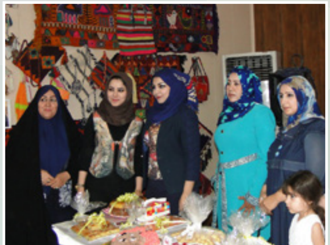
UNIDO's Enterprise Development Centre at the Iraq Women Crafts and Design Show, Iraq

Gender awareness and reliable data can help SMEs in developing countries to act as suppliers to large multinationals. The increasing emphasis on Corporate Social Responsibility (CSR) has seen many large international firms include gender-related criteria when assessing the suitability of enterprises and clusters in developing countries as business partners or suppliers. Yet many enterprises continue to overlook the full innovative potential of women employees because senior management either do not know how to harness their insights or lack the foresight needed to endorse their ideas. Research shows that teams with even as few as one woman member perform better than male-only teams in terms of recognizing new opportunities and acting upon them.