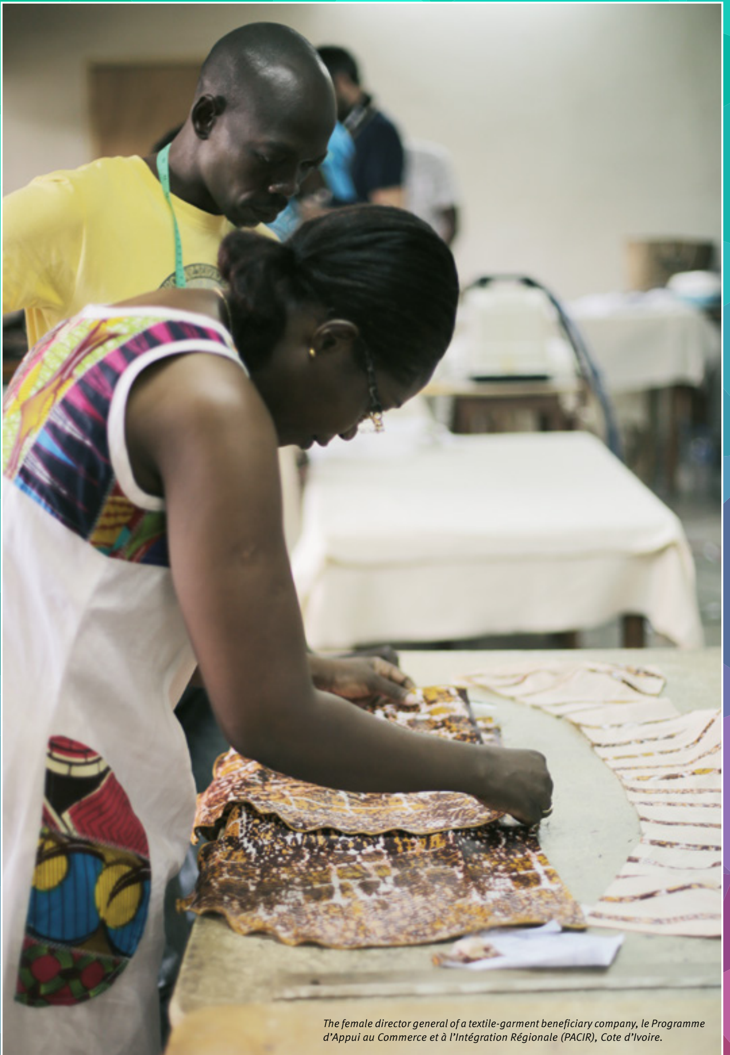
The female director general of a textile-garment beneficiary company, le Programme d'Appui au Commerce et à l'Intégration Régionale (PACIR), Cote d'Ivoire.