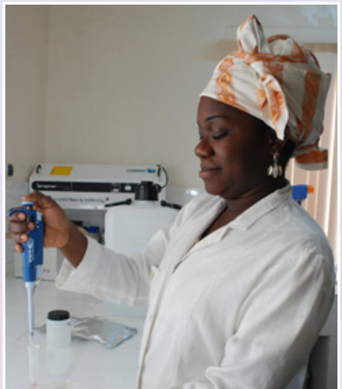
Testing a sample at a laboratory facility assisted by the West Africa Quality System Programme, Benin

It is important that both women and men participate in and benefit from capacity-building and technical activities on an equal basis and that both are given the same