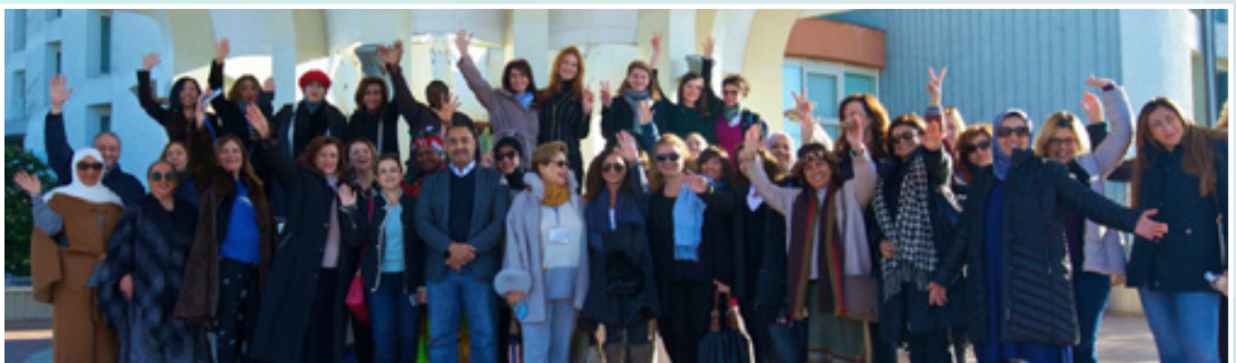
ITPO Italy event 'When Creativity meets Business: Sharing Stories of Women Entrepreneurs for Local Development, December 2015, Matera, Italy

Implemented by ITPO Bahrain, the Enterprise Development and Investment Promotion (EDIP) programme is designed to build and strengthen the business and technical skills of potential and existing entrepreneurs, with a particular focus on those led by youth and women, thus enabling them to start or expand their own businesses. The programme provides a variety of support services including business counselling, market assessments, technology selection, business plan preparation and access to finance. First developed in 2000 in Bahrain, the EDIP programme has since been successfully implemented in 38 countries. The majority of programmes are in the Middle East and North Africa (MENA) region, where women's economic and public participation is the lowest in the world. Strengthening women's empowerment in MENA countries can support inclusive growth by fostering investment in human capital and stimulating female labour force participation. Further, entrepreneurship is a largely untapped source of vital human capital for the region. In order to address these gaps, the programme seeks to target 20,000 beneficiary women entrepreneurs by 2020 through the EDIP 'training of trainers' feature where participants of the programme provide entrepreneurship training to other women.