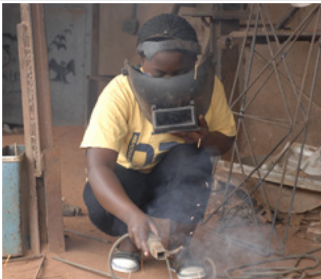
Women working in the manufacturing sector in Nampula, Mozambique

As the driving force of economic development, innovation is crucial for developing economies and economies in transition. The explosion of ICT over the last two decades has driven the emergence of knowledge-based economic activities. If developing countries are to take their place successfully in global markets and to build a competitive edge which is not dependent on low cost labor, low value added, or raw materials, they must carefully nurture an effective and efficient National System of Innovation (NSI). To this end, TII supports countries such as Ghana and Kenya to attain a position in the Information Age by ensuring that an ICT component is integrated into their overall development strategies, and by overseeing long-term monitoring and adaptation through the information generated by Science, Technology and Innovation (STI) Observatories. Innovation plays a vital role in the empowerment and emancipation of women, securing freedom and resources for them to make their own decisions, build confidence, and act in their own interests. It can help to reshape their roles in society.